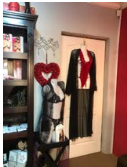
Products at the Pure Plesier Sensual Boutique.